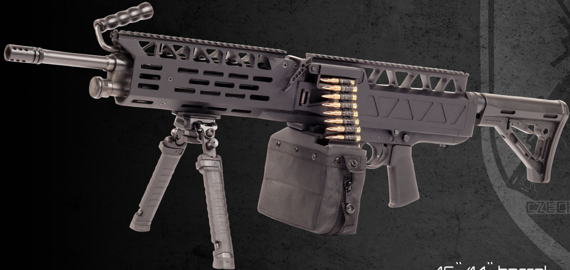
16" /14" barrel