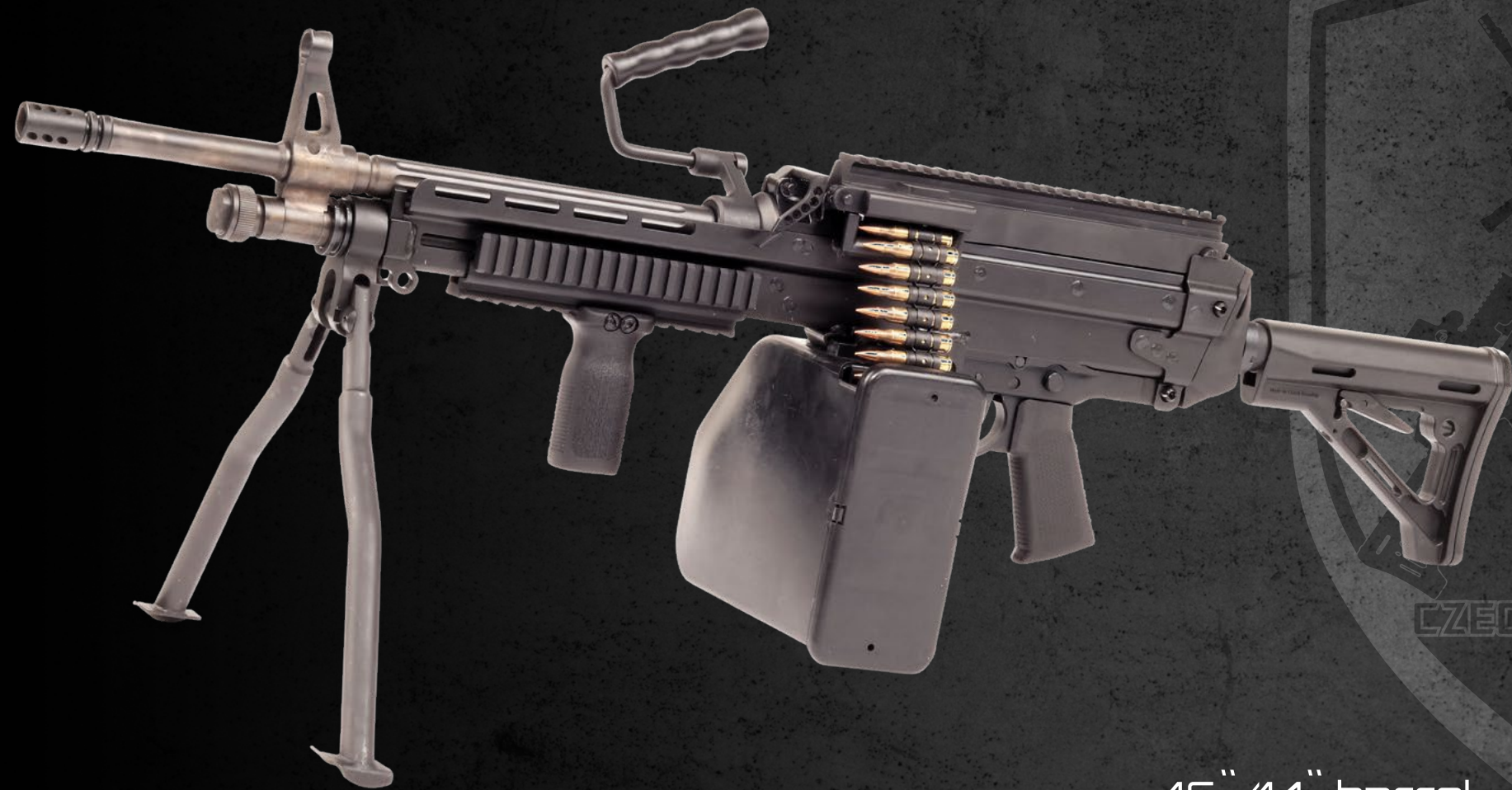
16" /14" barrel