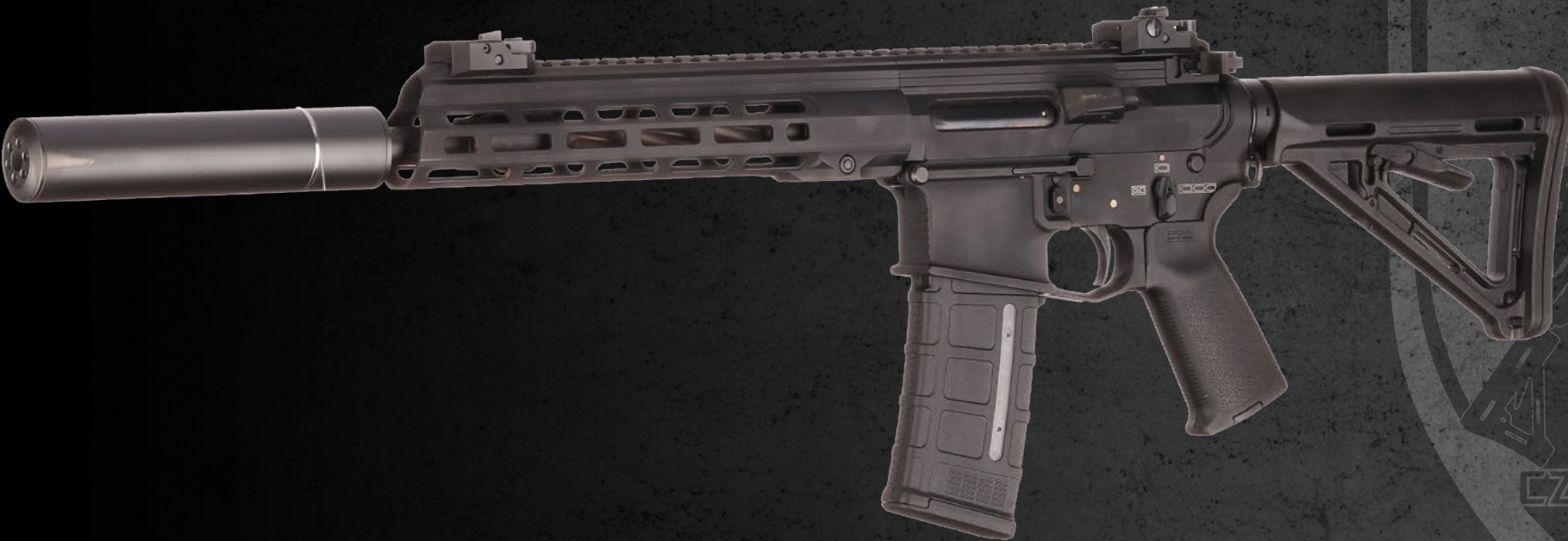
11.5 inches / 16.5 inches barrel